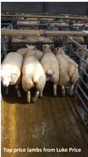
Top price lambs from Luke Price